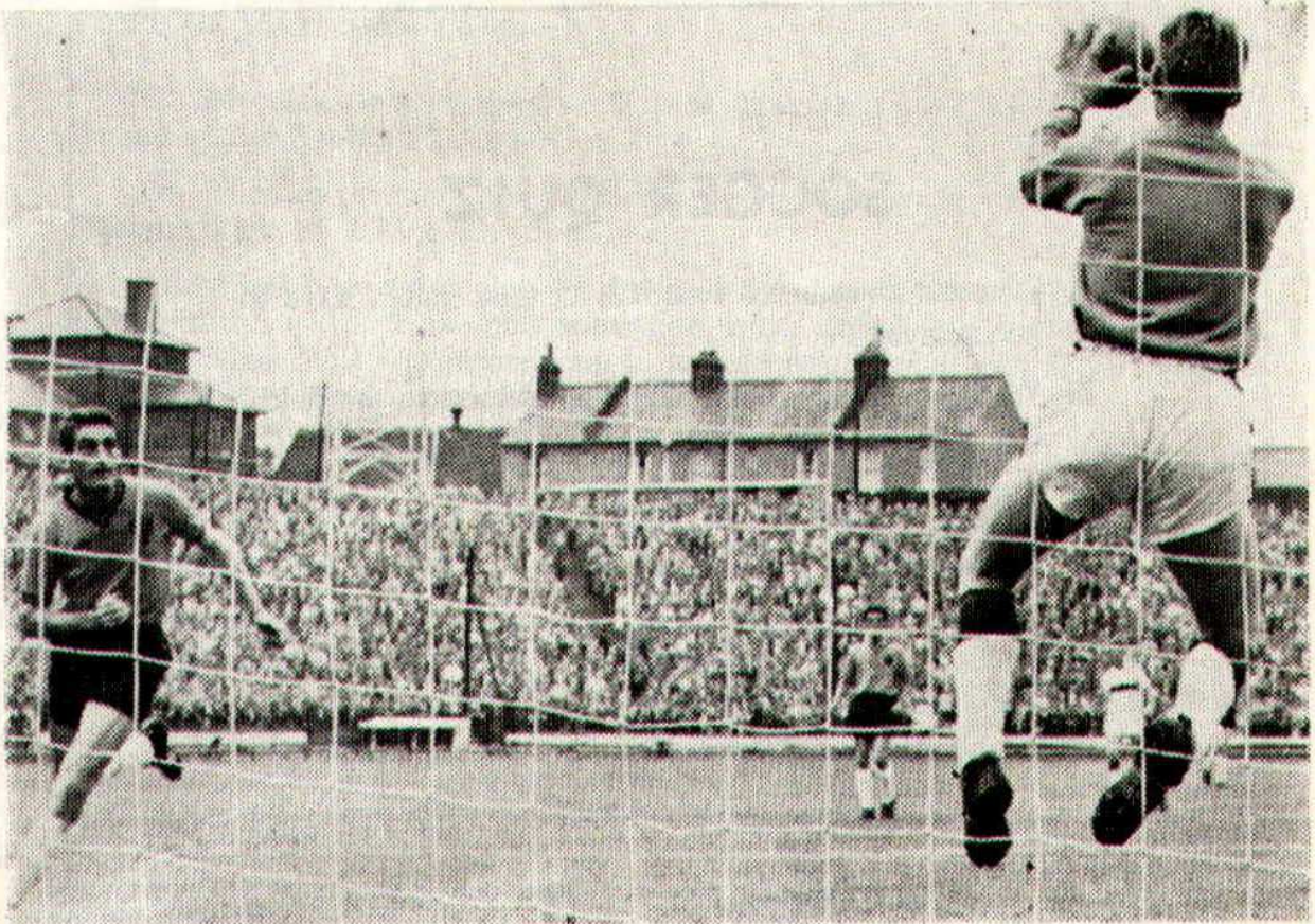
Coe checks a Holton attack